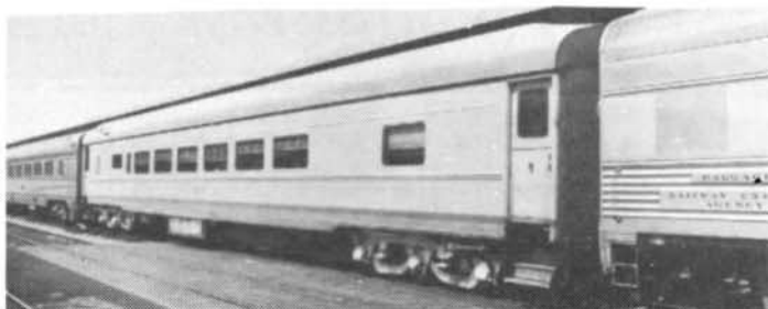
PSRMA'S COACH 576 - A "modernized" heavyweight former Union Pacific coach. Now used for museum excursions.

Since its founding nine years ago, the PSRMA has acquired several historic pieces of railway equipment. Included are four steam locomotives: a 1923 O-6-OT saddle tank engine from the E. J. Lavino Co.; a 1923 O-6-OT saddle tank engine from the Mojave Northern Co.; a 1923 shay type engine and a 1929 2-8-2T saddle tank engine, both from the Georgia-Pacific Corporation.