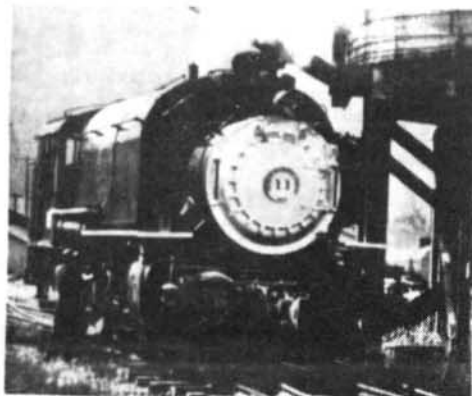
PSRMA'S #11 - Latest acquisition from the Georgia-Pacific Co. is this 1929 saddle tank oil-burner which will be operational after minor repairs to the boiler.

In addition to the motive power, the museum owns an array of railroad equipment including a Santa Maria Valley railbus, a former Union Pacific passenger coach, a wooden sided boxcar, two vintage tank cars and two truss rod flatcars. Other items such as depot signs, lanterns, baggage carts plus numerous related railroad items are waiting for display in the museum.